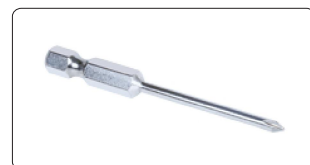
Phillips screwdriver bit (included)