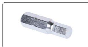
hex screwdriver bit (included)